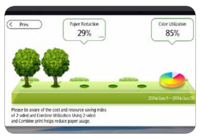
Eco-Friendly Indicator Screen as shown on Smart Operation Panel.

We strive to be stewards for the environment. That's why we give you more ways to take responsibility for your own energy and paper use. The Lanier MP C401/MP C401SR offers expanded energy-saving modes to reduce power consumption. Program it to shut down or power up automatically to conserve energy during expected downtimes. Take advantage of standard duplexing to reduce paper and associated costs. Set print quotas for individual users or groups to reduce unnecessary printing. And, use the built-in Eco-Friendly Indicator to see how much paper your team is saving. These models meet the new stringent standards for ENERGY STAR<sup>™</sup> 2.0 certification and have qualified for an EPEAT<sup>®</sup> gold rating.