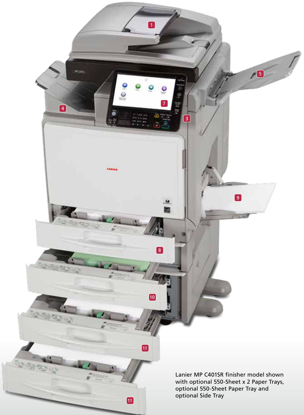
Lanier MP C401SR finisher model shown with optional 550-Sheet x 2 Paper Trays, optional 550-Sheet Paper Tray and optional Side Tray